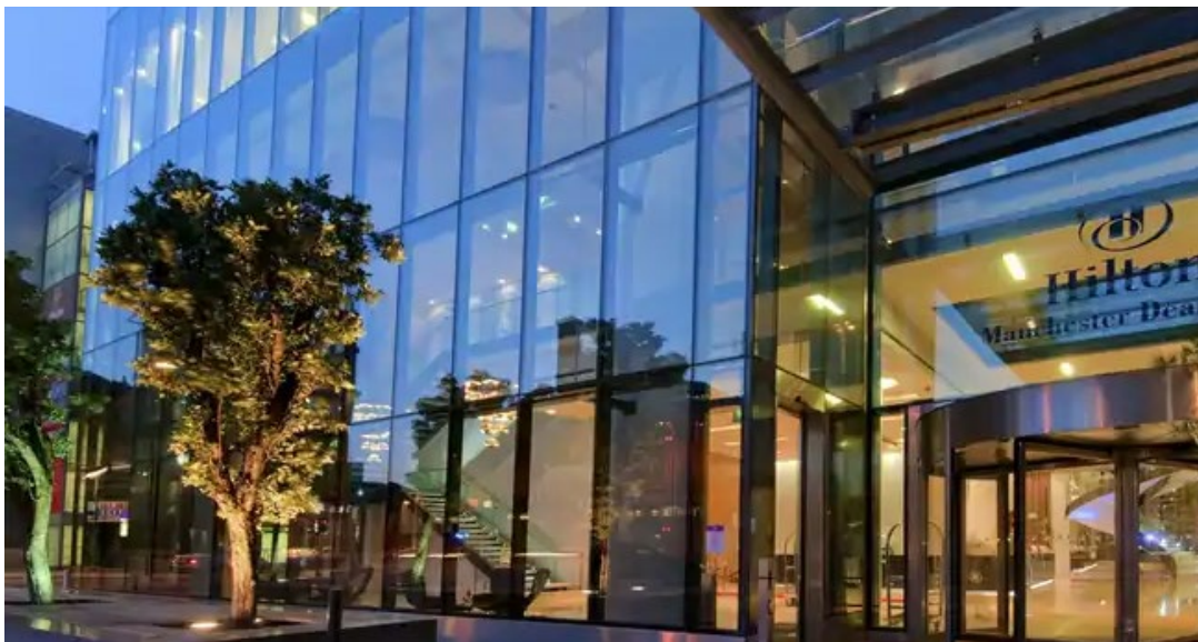
Hilton Deansgate Manchester